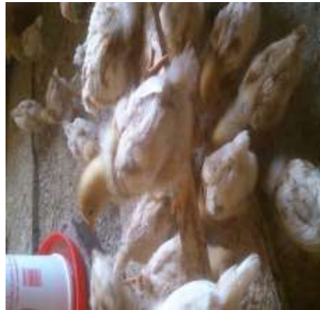
Two weeks old chicks