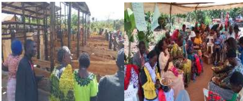
Trainings at the model farm

With the small income from the fruits and vegetables on the farm, the model farm is maintained. Since the number that comes to the model farm has increased, KAP has decided to charge affordable fee i.e. Ugx 1,000 per student (children and youth in primary and secondary schools) and Ugx 50,000 per a group of 10 members. This fee includes refreshments for the trainees and the balance is used for maintenance of the model farm.