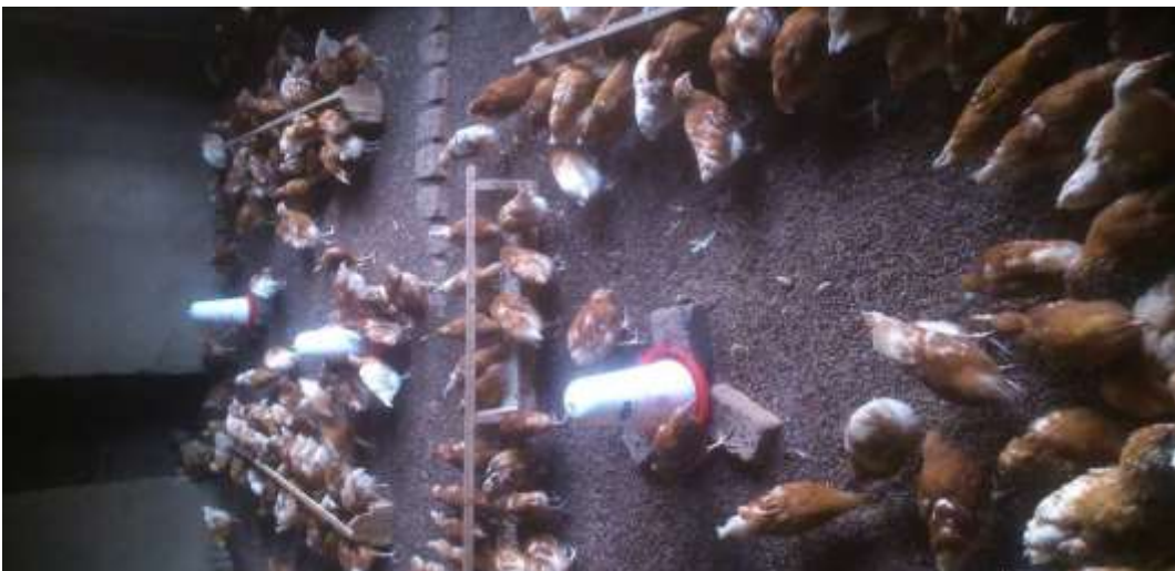
One month old chicks from the brooder