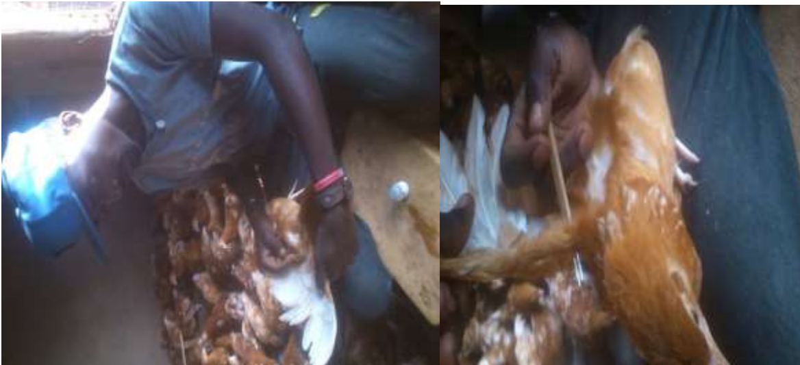
Carried out Fowl pox vaccination using a needle, 2 months old hens