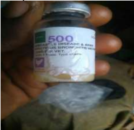
Vaccination for Newcastle Disease after week one