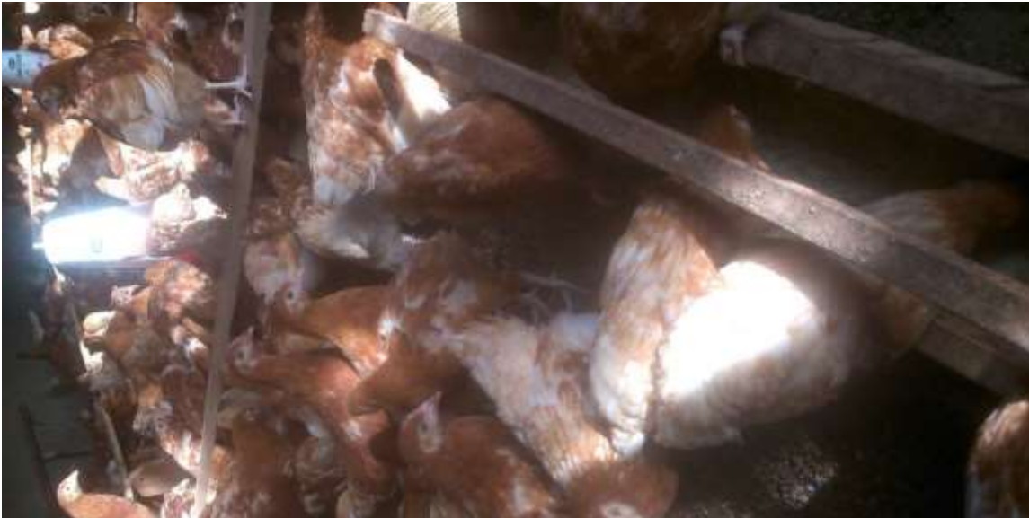
2 months old hens