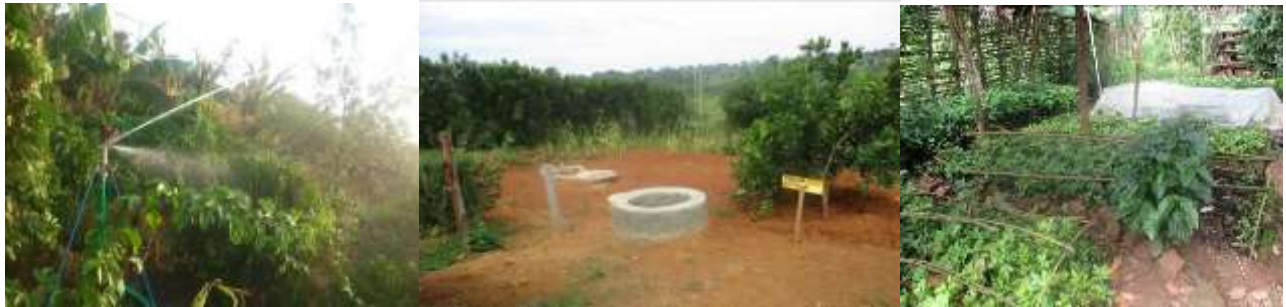
Some of the projects on the model farm for demonstration and KAP IGA purposes.