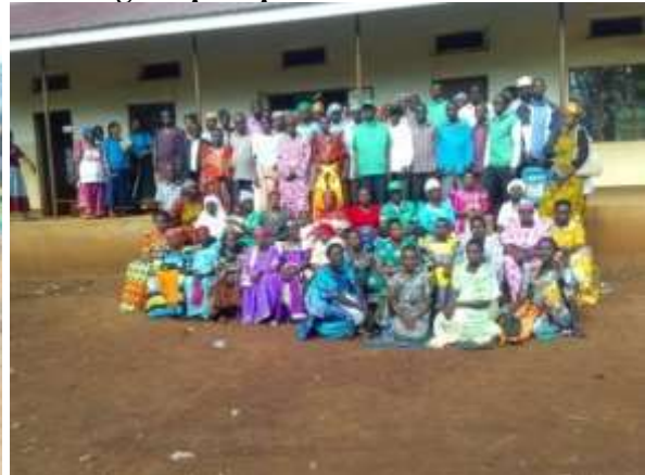
Officers from SMU and KAP officers Participants from different groups of KYAMULIBWA