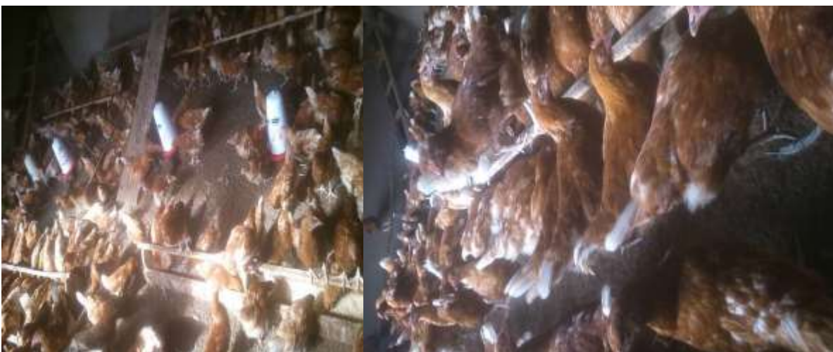
3 months old hens