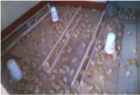
Day one old chicks under brooding

People with similar interest come together and work together to achieve that interest. There is a group of 8 members who have come together to do a poultry. The team paid membership and is required to pay annual subscription for maintenance of the poultry. The group selected one of the members to manage the operations of the poultry. The team trained in the biosecurity, animal welfare, feed delivery and daily card reports.