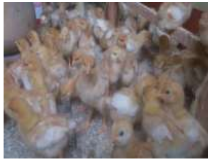
One week old chicks